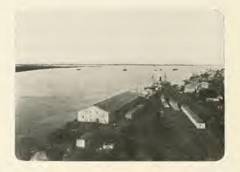
River Paraná from Grain Elevator.

The physical characteristics of the bed of the river are, consequently, entirely different from those of the Uruguay; the bed of the latter is stable, that of the former very unstable. The sedimentary matters carried in suspension, however, are very much less than those of the Mississippi ; probably only one-tenth of the amount carried in the Mississippi in times of flood For this reason the changes in the bed and banks are less radical; the most noticeable change is the movement of the islands