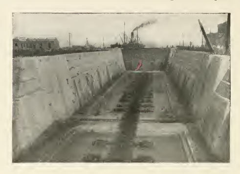
The Dock, Keel and Bilge Blocks.

is in an estuary of the Ocean, and is a protected harbor; in fact, the terminal of the Railway is about 35 miles from the open ocean. The Railway is building a steel pier, 1640 feet long, with spacious