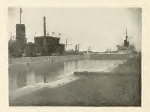
The President inagurating the Dock.

warehouses and 19 miles of siding; and there will be, when all works are completed, over half a mile of wharf frontage, supplied with electric cranes. The National Government is building in this