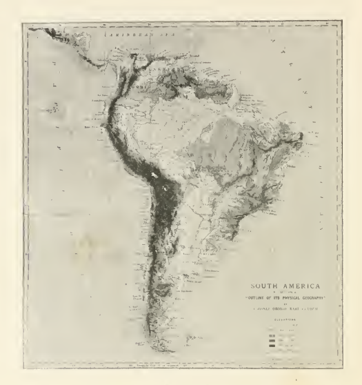
Orographic Map of S. America.

An orographic map of South America will show what immense areas are given up to mountain ranges and lofty summits. In their widest part the Andes are 500 miles in breadth. Some mighty