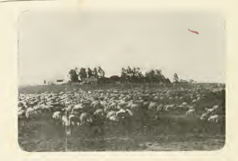
Flock of Sheep.

Since that date the imports into Great Britain have rapidly increased, and recent dispatches from London relate how this factor in the London meat market is alarming the Beef Trust of the United States and the Australian shippers. Argentine is placing its chilled meat in London at a considerably lower price, and is competing successfully with meat from the United States.