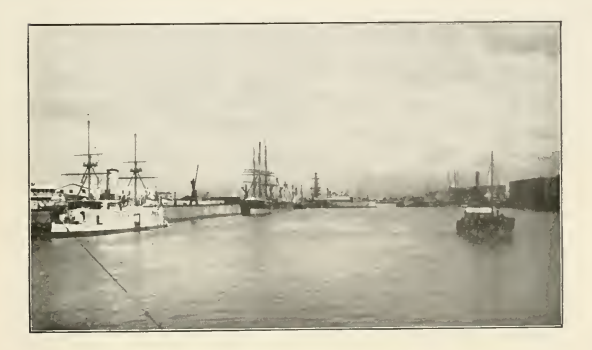
View of the Docks.

In 1880, about the time that the works were proposed, the tonnage was 644,570, and the plans were made for 2,000,000 tons only.