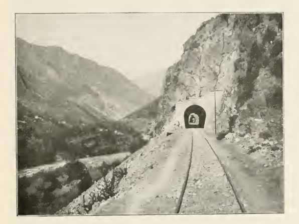
First Tunnel out of Mendoza.

avalanche. The railroad is not completed, and some of the most difficult work is yet to be done