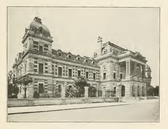
Water Works Building.

In 1868 there was a terrible epidemic of yellow fever due, in a large part, to unsanitary conditions, but immediately afterward the city- began a very extensive system of water and drainage works costing 33 millions of dollars (gold), discharging the sewerage 15 miles distant, and the storm waters by great intercepting sewers, now being completed, into the river in front of the city. The City Water-works take their water above the city, where it is never contaminated. These works were designed by Messrs. Bateman and Parsons, Engineers, of London, and the main construction was carried out under their supervision.