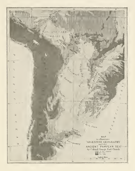
Ancient Pampean Sea and Lake Mojos.

When, in the processes of Nature, the great underwater plains of rich soil had been formed during the comparatively short period of less than 100,000 years, a dam was thrown across the Madeira by the rivers Grande and the Parapiti coming down from