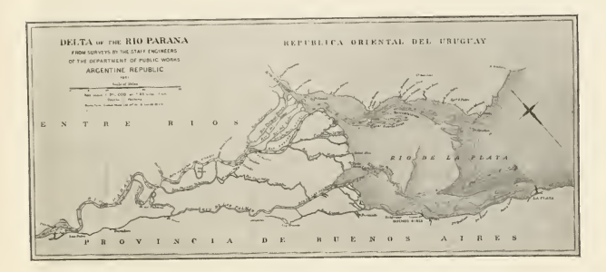
La Plata Superior and Delta of Paraná

In reference to the Rio de la Plata itself, it is an immense shoal estuary. It is the depositing ground of the great Paraná River. This estuary, in a not very remote period, extended above Santa Fé; this is shown by the comparison of old maps, of which 92 have been collected and copied and placed in the Library of the Ministry of Public Works. These maps date from the year 1529 to 1885. Even in this comparatively short period, remarkable changes are shown in the Delta of the Paraná, which is now a true delta, almost exactly in the form of the Greek letter \triangle . It is 40 miles across its face; it