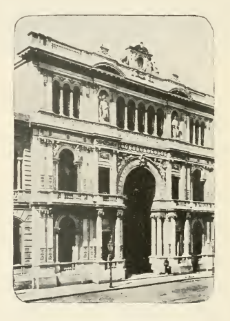
Entrance Government House.

You will be interested to know that at Buenos Aires, there is a large business with New York by means of five steamship lines, and through New