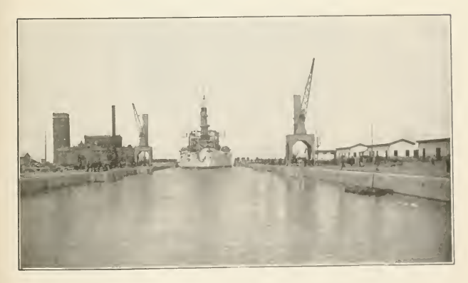
U. S. Battleship Iowa entering the dock.

This dock, built of first class materials and upon the most modern methods, can take the largest naval or merchant ships of the World, as it has a useful length of 713 feet and an entrance width of 85 feet, and a depth over the sill of 32 1/2 feet at