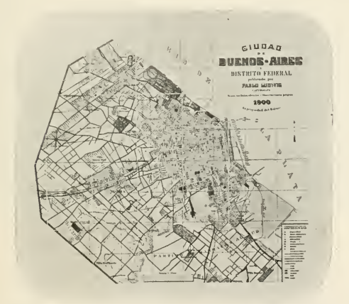
City of Buenos Aires.

Its early history is full of trouble. Founded in 1535, destroyed and rebuilt; and then from 1650,